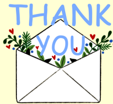
From the Pastor

times before the series begins. Read it from several different translations of the Bible, such as NRSV, NIV, NEV, The Message, King James or the New King James. It is always interesting to hear the Psalm in different voices/perspectives/translations! Pastor looks forward to sharing with you as we walk through this Psalm on Sunday mornings (April 21, 28 & May 5 and 12th ).